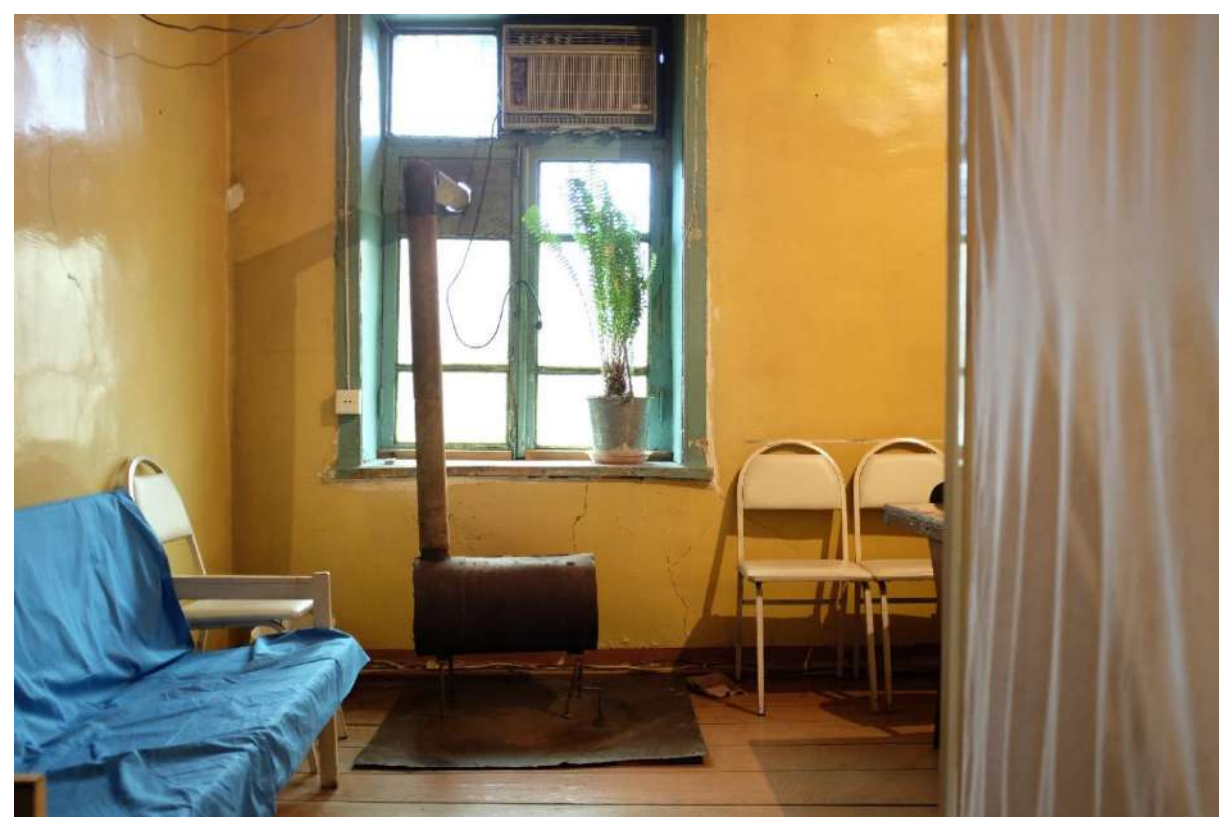
Chief doctor's room, Karrar hospital, Kurdamir