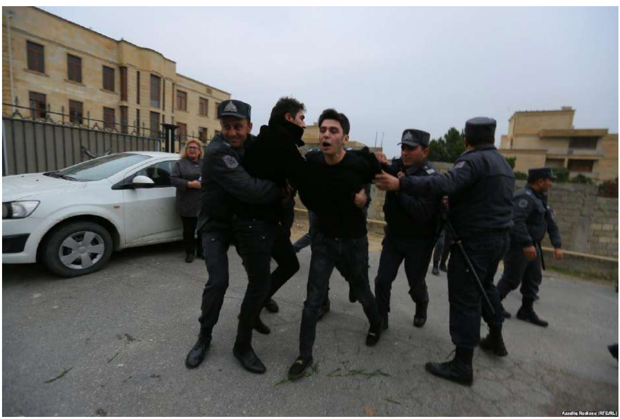
In front of Sabail Police Department 17 November

Politically motivated persecutions continued and the number of political prisoners reached 131 The freedom of expression remained limited. The number of blocked news websites increased to 40 while the travel bans imposed on independent journalists and civil society activists remained unchanged. The work of the civil society organizations continued to be obstructed as did the freedom of assembly.