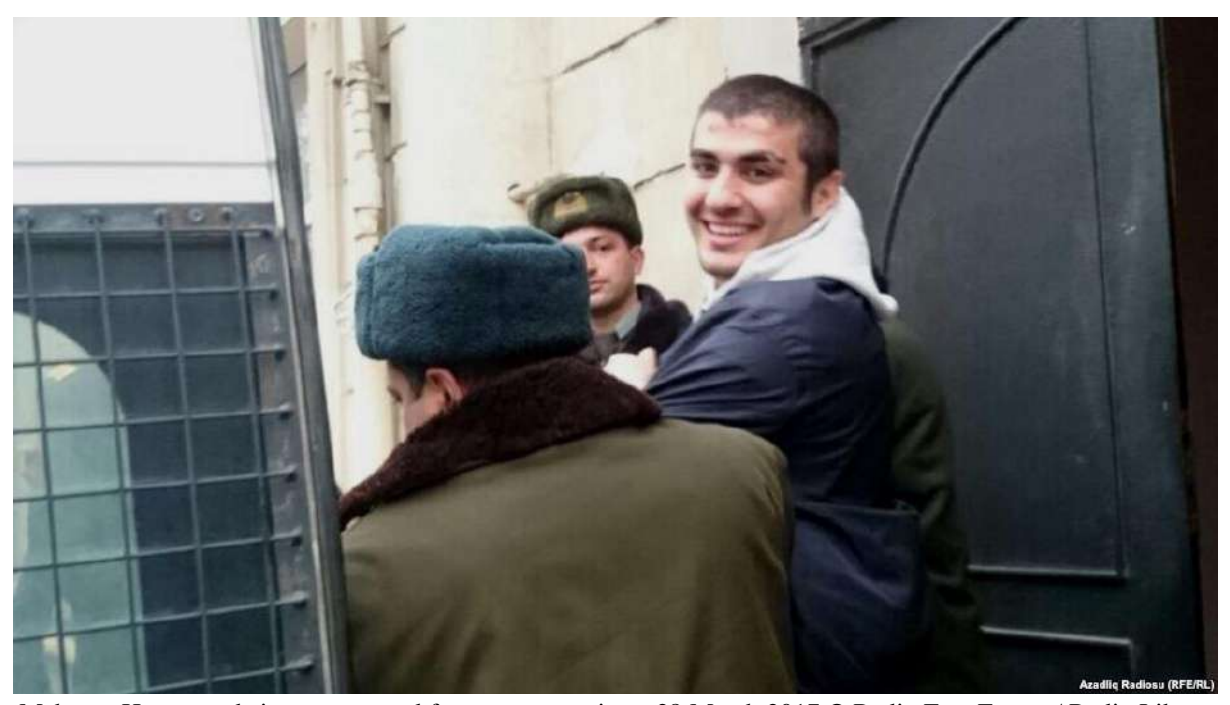
Mehman Huseynov being transported from court to prison, 28 March 2017

On 26 December, the authorities opened a new criminal investigation against imprisoned blogger Mehman Huseynov after the prison administration claimed that he assaulted one of the guards just two months before the end of his sentence. Huseynov launched a hunger strike in a protest. Following domestic and international pressure, the authorities dropped the criminal investigation on 22 January 2019.