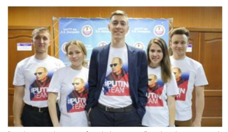
"Student Headquarters for Vladimir Putin" at the Altai State Technical University

According to several Altai media reports, in one branch of the Altai State Technical University—Biysk Technological Institute—the head of the local student council <u>sent out</u> coercive messages asking students to sign in support of the nomination of Vladimir Putin. According to Russian legislation, participation of a Russian citizen in elections is free and voluntary. No one has the right to exert influence on citizens to force them to participate or not participate in elections, or to impede their free expression of will.